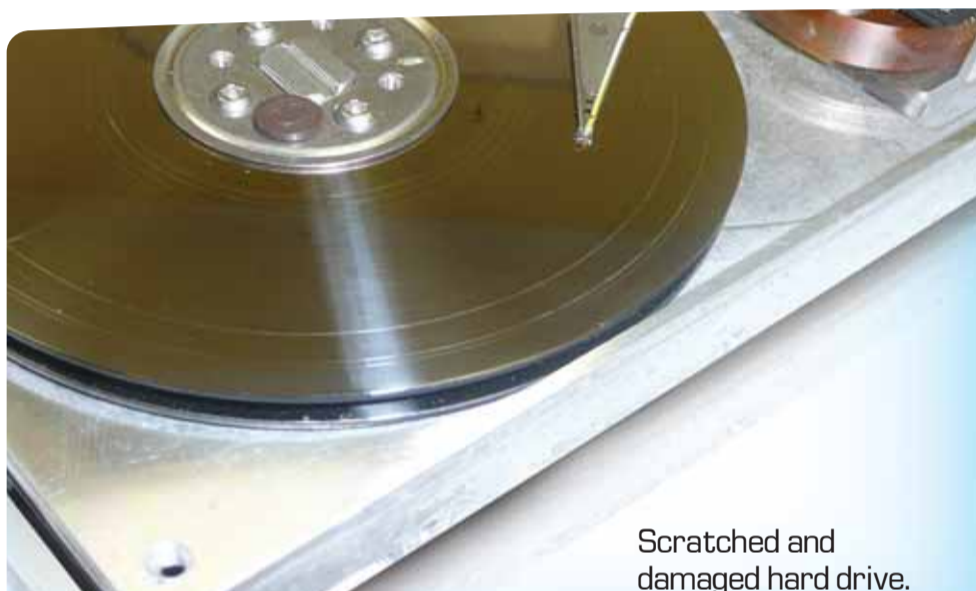
Scratched and damaged hard drive. Data not recoverable.