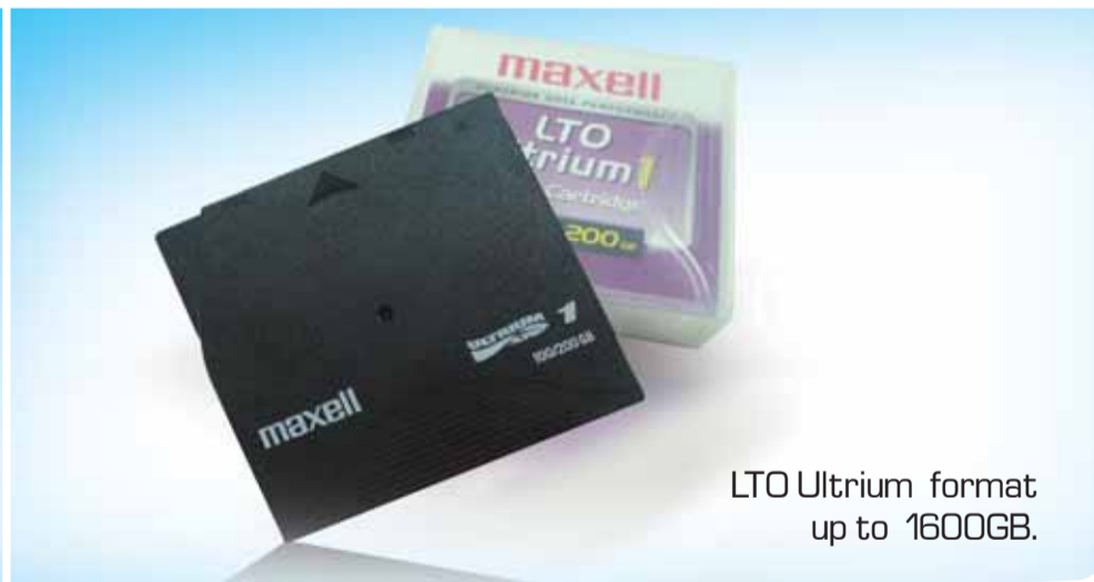
LTO Ultrium format up to 1600GB.